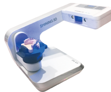
Black & White Texture